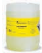
CHLORBRITE Chlorine Bleach, 10%, EPA registered