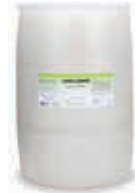
CHALLENGE Heavy-Duty Degreaser